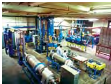
Pilot Plant Lab Facility