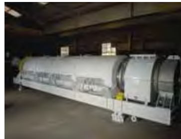
Renneburg Rotary Calciner

At Heyl & Patterson, we've been pioneering solutions for the chemical processing industry since 1887 – let our experience work for you. For further information, visit www.heylpatterson.com or call today.