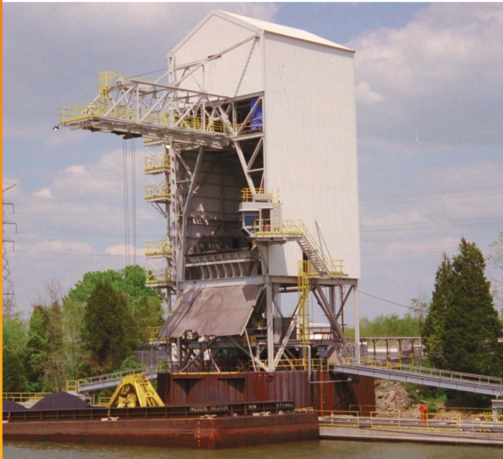
Grab Bucket Unloader

From visual mechanical or structural inspections to electrical evaluations, Heyl & Patterson's qualified inspections team can help keep your equipment functioning effectively.