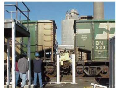
Observation of operations.