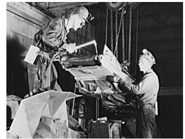
Vintage photo from our archive.