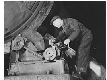
Vintage photo from our archive.

Whether you need consulting on parts installations, outage planning and assistance, maintenance recommendations, comprehensive upgrades, or startup assistance on new equipment, our field service engineers offer on-site mechanical, structural and electrical inspections with preventive maintenance programs—helping to extend the life of your machinery while maximizing efficiency, productivity and safety.