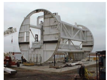
On site during construction rotary dumper.