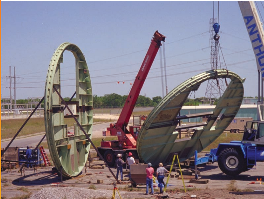
Assembly of rotary dumper.

Heyl & Patterson Inc. has been providing advanced field services for more than a century.