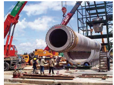
On site during construction rotary dryer.